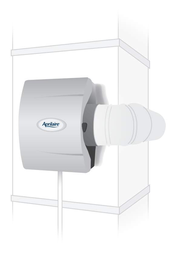
Your dealer will recommend the ideal model and placement for your home.

Optimal humidity also helps you stay warmer at cooler temperatures. That means you can lower your thermostat and save energy, thereby lowering your heating costs.