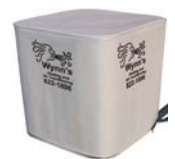
Custom Printed Covers