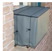
Window Unit Covers