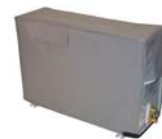
Ductless Split Covers