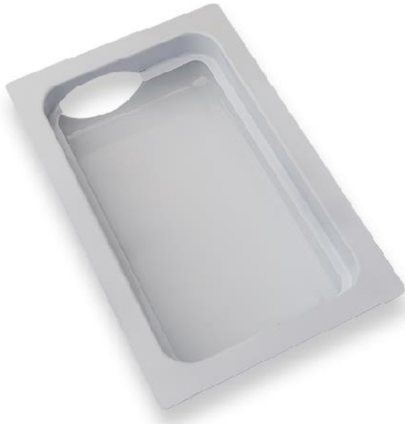
DBX1000M Metal dryer vent box with snap on trim ring