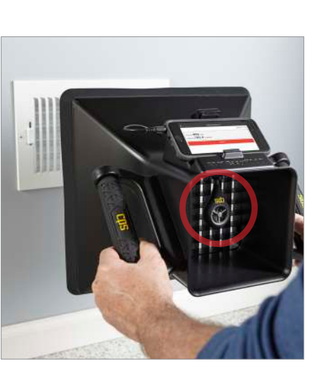
Mount inside ABM EasyHood (sold separately)