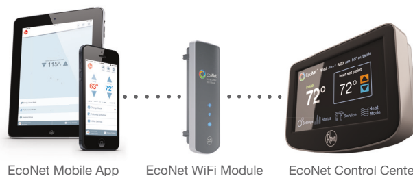
EcoNet Mobile App

The EcoNet Control Center serves as the hub of communication for a home's Heating, Cooling and Water Heating systems, and is required to operate an EcoNet Enabled Heating & Cooling system in a fully communicating mode. The Control Center is compatible with Comfort Control 2 System™ Air Conditioner and Heat Pump models when matched with a R96V or R802V Gas Furnace, or a RHMV* or RH2T* (EEV**) Air Handler. It also works with EcoNet Enabled Electric and Hybrid Tank Type Water Heaters.