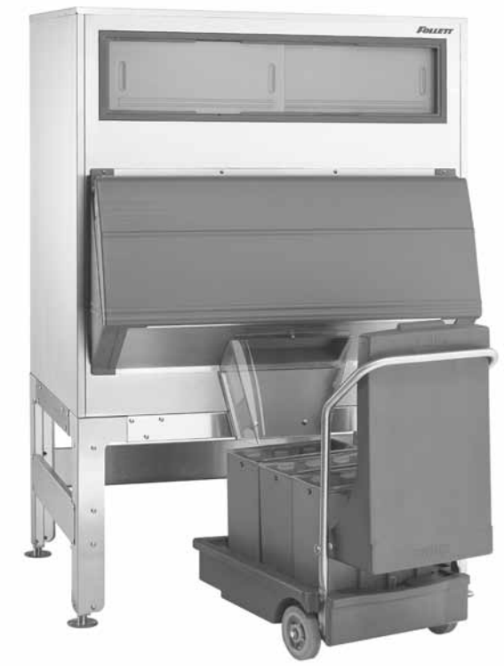
Model DEV1010SG-48 with SmartCART 75 ice cart