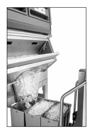
Ice flows smoothly through chute into Totes ice carrier when chute door is opened

Elevated, chuted ice storage bin and cart systems use gravity to load ice into cart. System provides exceptional labor-savings, sanitation and safety for foodservice operations using cube and Chewblet* ice. (Not recommended for flake ice.)