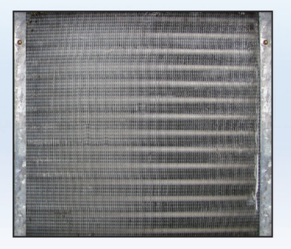
Coil after UV light application