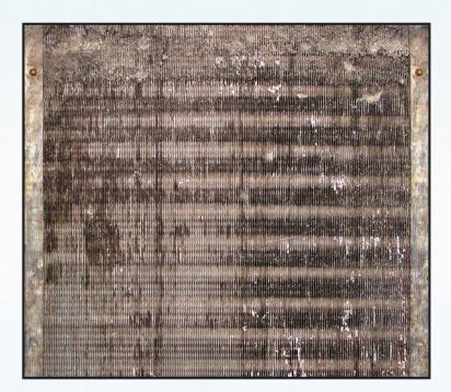
Coil with mold