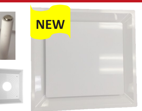
HT-2X2-PSPL BOOT DIAMETER OPTIONS