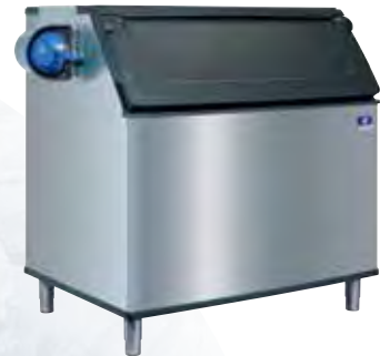
D-Style Ice Storage Bins

Available in 22" (55.9 cm), 30" (76.2 cm) and 48" (121.9cm) widths. Featuring one-piece corrosion-free composite-resin base, impact-resistant polyethylene bin liner, soft durameter trim that helps silence bin closing, internal scoop holder and protectant bumper guards. Optional Multi-mount external scoop holder also available.