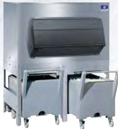
Ice Storage Bin and Cart System

Equipped with ice gate for increased employee safety, easier ice removal, and reduced spillage. The 30" (76.2 cm) model is one of the smallest footprint large capacity storage bins available.