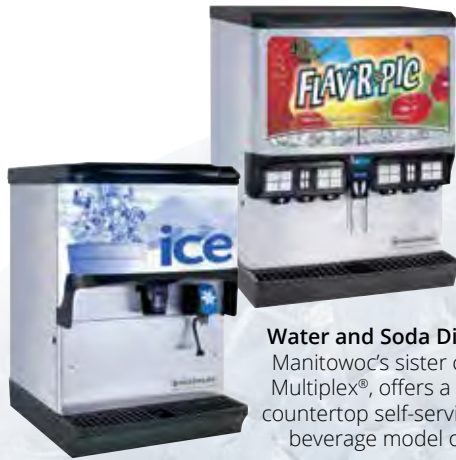
Water and Soda Dispensers Manitowoc's sister company, Multiplex®, offers a complete countertop self-service ice and beverage model offering.

Find the perfect ice machine pairing with Manitowoc's wide variety of ice storage bins and dispensers.