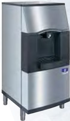
SPA and SFA Series Ice Dispensers

Available in 22" (55.9 cm), 30" (76.2 cm) and 48" (121.9cm) widths. Featuring one-piece corrosion-free composite-resin base, impact-resistant polyethylene bin liner, soft durameter trim that helps silence bin closing, internal scoop holder and protectant bumper guards. Optional Multi-mount external scoop holder also available.