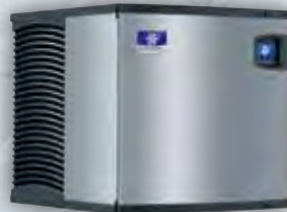
Modular Ice Machines

Featuring high-volume dispensing with patented "push-for-ice" rocking chute dispense mechanism and paddle wheel technology. Also available in an ice and water dispensing.