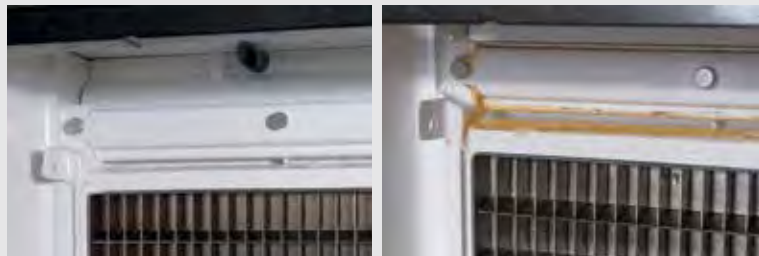
Without LuminIce II

The LuminIce II device runs quietly 24 hours a day keeping your ice machine cleaner and helping to relieve the stress and pain of frequent cleanings due to challenging foodservice environments where yeast, flour, and other contaminants create an environment favorable to growth. Reduced cleanings ultimately saves labor time, cost, and machine downtime during the cleaning process.