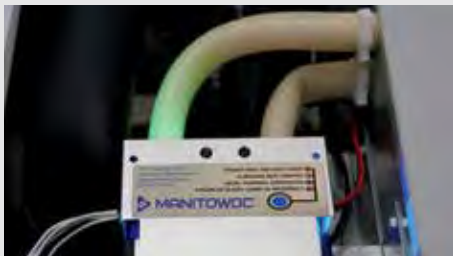
With LuminIce II

The LuminIce II space-saving design fits inside the ice machine so existing exterior clearances are not impacted. In addition, power for the unit is supplied through the ice machine's internal electrical supply so outlet space is conserved.