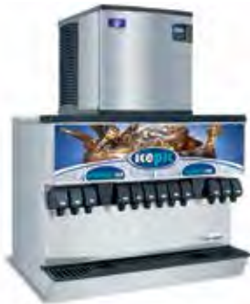
iT420 ice machine on Multiplex® MDH-302 beverage dispenser

Manitowoc dice or half dice cubes crushed into small pieces using a Maniowoc machine and a Multiplex® beverage dispenser equipped with icepic® ice crusher. Provides a selection