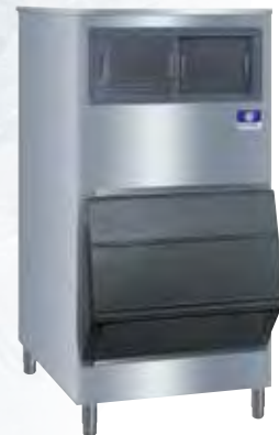
F-Style Large Capacity Ice Storage Bins

Available in 22" (55.9 cm), 30" (76.2 cm) and 48" (121.9 cm) widths.