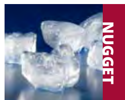
RNF0320 nugget ice machine on Multiplex® SV-250 beverage dispenser