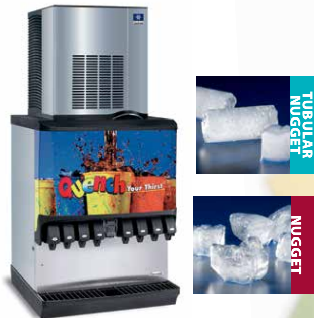
RN-0408A nugget ice machine on Servend® SV-250 beverage dispenser