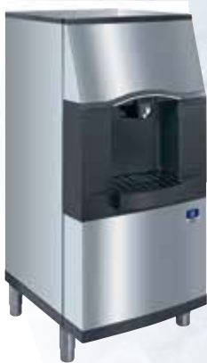
SPA and SFA Series Ice Dispensers

Featuring one-piece corrosion-free composite-resin base, impact-resistant polyethylene bin liner, soft durameter trim that helps silence bin closing, internal scoop holder and protectant bumper guards.