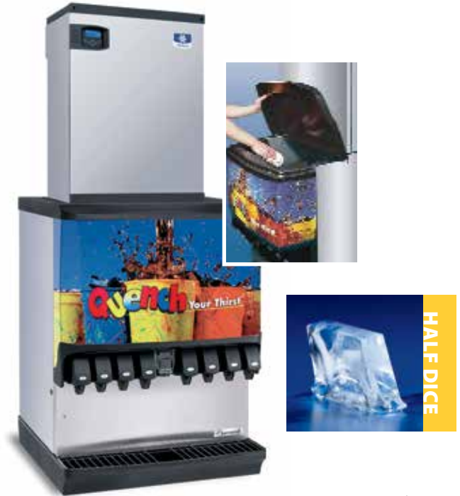
Ice/Beverage Series 1090C ice machine on Servend SV-250 beverage dispenser

This compact Ice/Beverage Series ice machine is available in high volume ice production capacities to satisfy nearly every beverage dispenser application at quick service restaurants, convenience stores, recreational or educational foodservice operations.