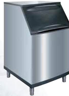
B-Style Ice Storage Bins

Available in 22" (55.9 cm) and 30" (76.2 cm) widths.