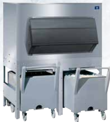
Ice Storage Bin and Cart System

Equipped with ice gate for increased employee safety, easier ice removal, and reduced spillage. The 30" (76.2 cm) model is one of the smallest footprint large capacity storage bins available.