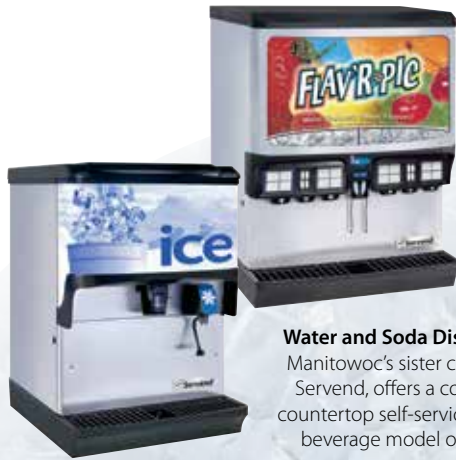
Water and Soda Dispensers Manitowoc's sister company, Servend, offers a complete countertop self-service ice and beverage model offering.

Find the perfect ice machine pairing with Manitowoc's wide variety of ice storage bins and dispensers.