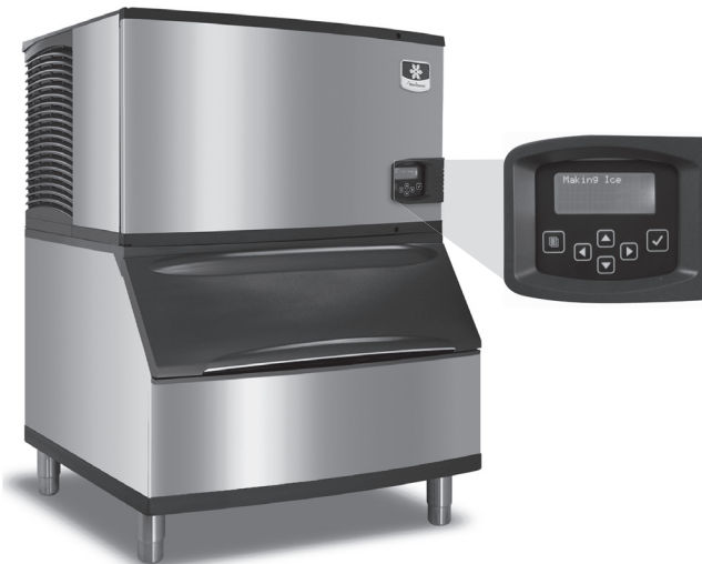
Indigo Series i-300 Ice Machine on B-170 Bin

Designed for operators who know that ice is critical to their business, the Indigo™ Series ice machine's preventative diagnostics continually monitor itself for reliable ice production. Improvements in cleanability and programmability make your ice machine easy to own and less expensive to operate.