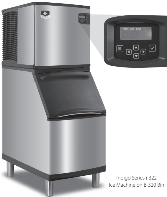
Indigo Series i-322 Ice Machine on B-320 Bin

Designed for operators who know that ice is critical to their business, the Indigo™ Series ice machine's preventative diagnostics continually monitor itself for reliable ice production. Improvements in cleanability and programmability make your ice machine easy to own and less expensive to operate.