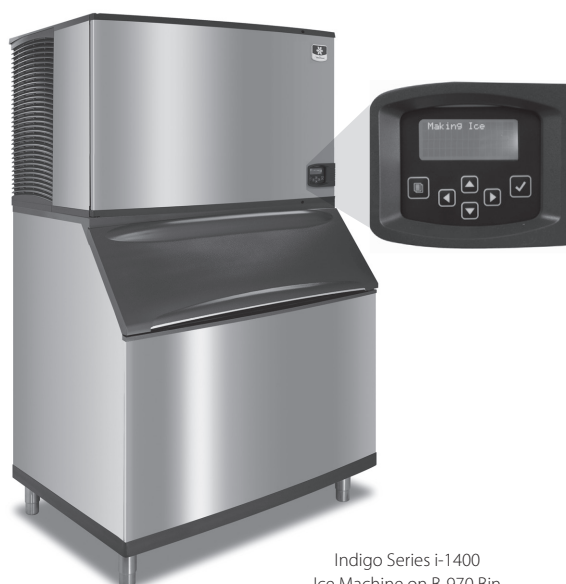
Indigo Series i-1400 Ice Machine on B-970 Bin

Designed for operators who know that ice is critical to their business, the Indigo™ Series ice machine's preventative diagnostics continually monitor itself for reliable ice production. Improvements in cleanliness and programmability make your ice machine easy to own and less expensive to operate.