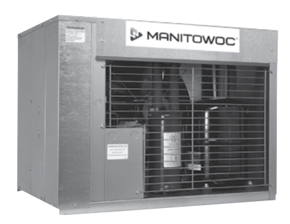
RCU Condensing Unit - 208-230V