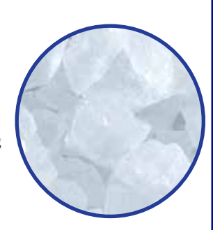
Ice shown actual size

Nugget ice consists of small pieces ranging from 3/8" to 1/2" in width and length on average. Offers a 85% ice to water ratio with a soft, chewable texture while still providing maximum cooling effect and great dispensibilty.