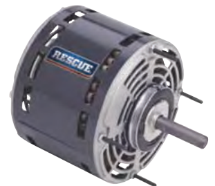
RESCUE® Direct Drive Blower Motor