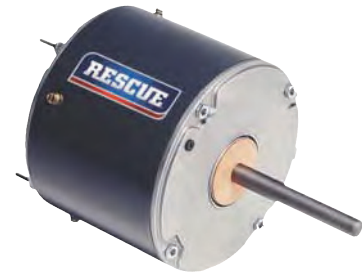
RESCUE® Condenser Fan Motor