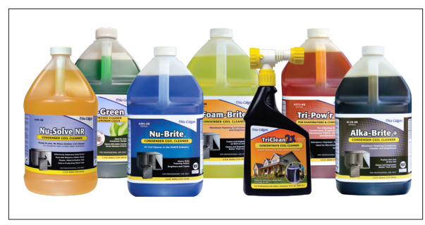
CONDENSER COIL CLEANERS

Regular cleaning with Nu-Calgon products protects equipment and helps maintain peak operating efficiency.