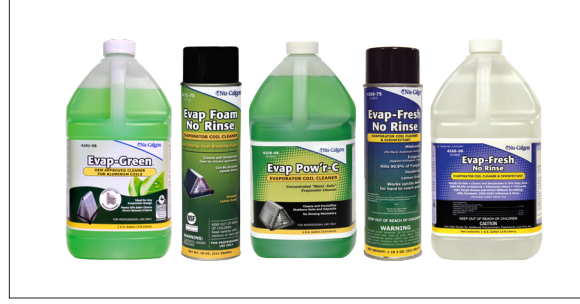
EVAPORATOR COIL CLEANERS