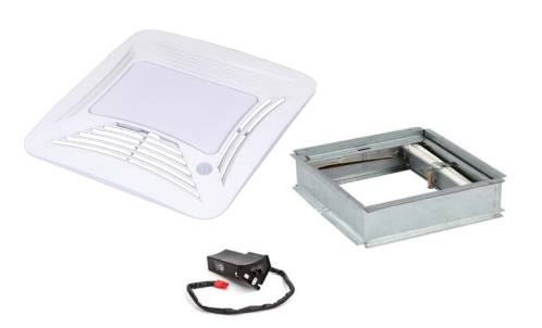
LIGHTED MOTION AND HUMIDITY SENSING GRILLE AND RADIATION DAMPER KIT PCDLMGRDP