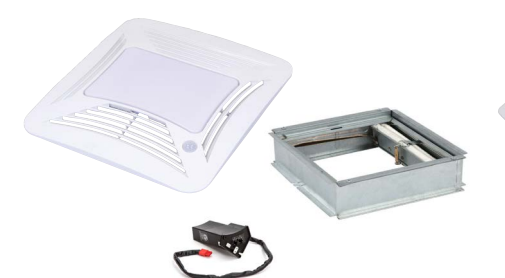
LIGHTED MOTION AND HUMIDITY SENSING GRILLE AND RADIATION DAMPER KIT PCLMHKRDP