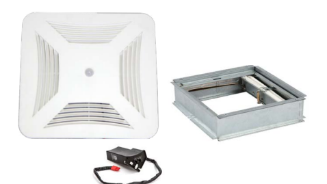
MOTION AND HUMIDITY SENSING GRILLE AND RADIATION DAMPER KIT PCMHKRDP