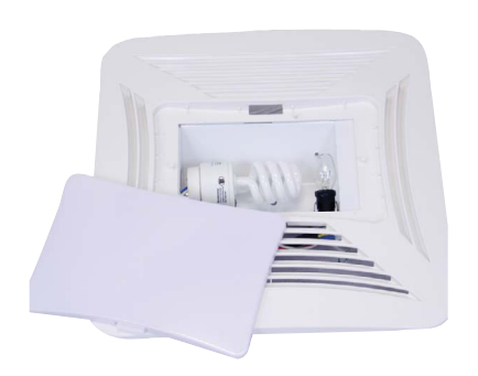
CFL Lighted Grille Kit -