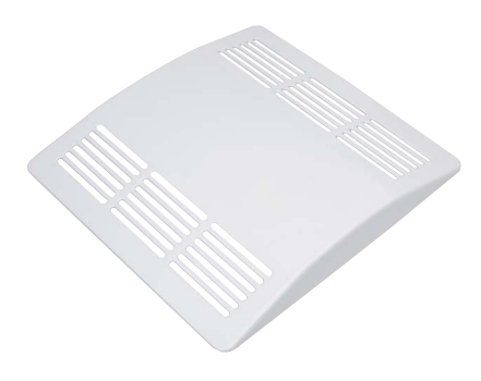
METAL GRILLE -