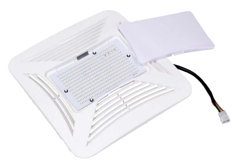
LED Lighted Grille Kit-