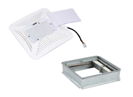
LED LIGHTED GRILLE AND RADIATION DAMPER KIT PCLEDKRD/PCLEDKRDP