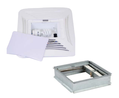
CFL LIGHTED GRILLE AND RADIATION DAMPER KIT PCLKRDP