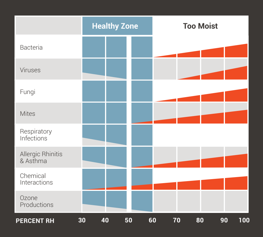
Chart data by the American Society of Heating, Refrigeration and Air Conditioning Engineers (ASHRAE).

Check out the chart to see how humidity affects your health. As the width of the bar increases, so does the likelihood of flourishing microbes and illnesses.