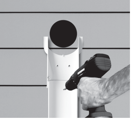
(2) Once all fitting bases are secured to the siding, measure and cut SD Ducting to fit as needed. Remember to account for some seasonal expansion and contraction. Install and fasten SD Ducting bases. Attach bases only to structure through provided punch outs using fasteners of sufficient length (not provided).