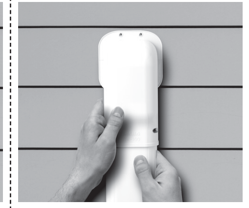
(4) Snap straight duct top over mating straight base pieces. Seat fitting tops over mating fitting bases and secure with provided stainless screws. Duct must terminate with a fitting to prevent cover from sliding out of position.