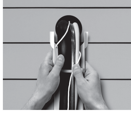
(3) Secure optional SL300 straps (strap kit not included) evenly spaced inside Slimduct. Run lineset, drainhose, wiring etc. over the fitting/duct bases and straps. Tighten straps to secure.