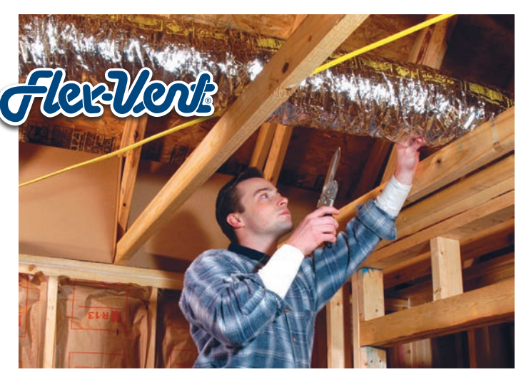
Flex-Vent® installs faster. Less waste. Oversize core for easy fittings.