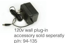
120v wall plug-in accessory sold separately p/n: 94-135

Optional PCO Air Purifier is also available separately, constantly cleans the air of VOC and biological odors and contaminants with zero ozone emission. part number 94-114-(12" or 17")