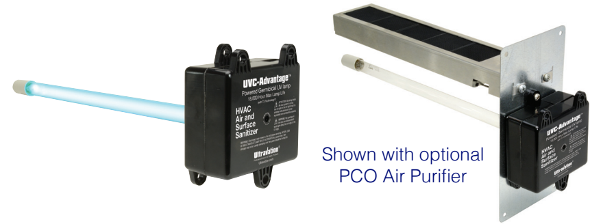
Shown with optional PCO Air Purifier

For Models: ADV1224, ADV1224-T3, ADV1224-PCO, ADV1224-T3-PCO